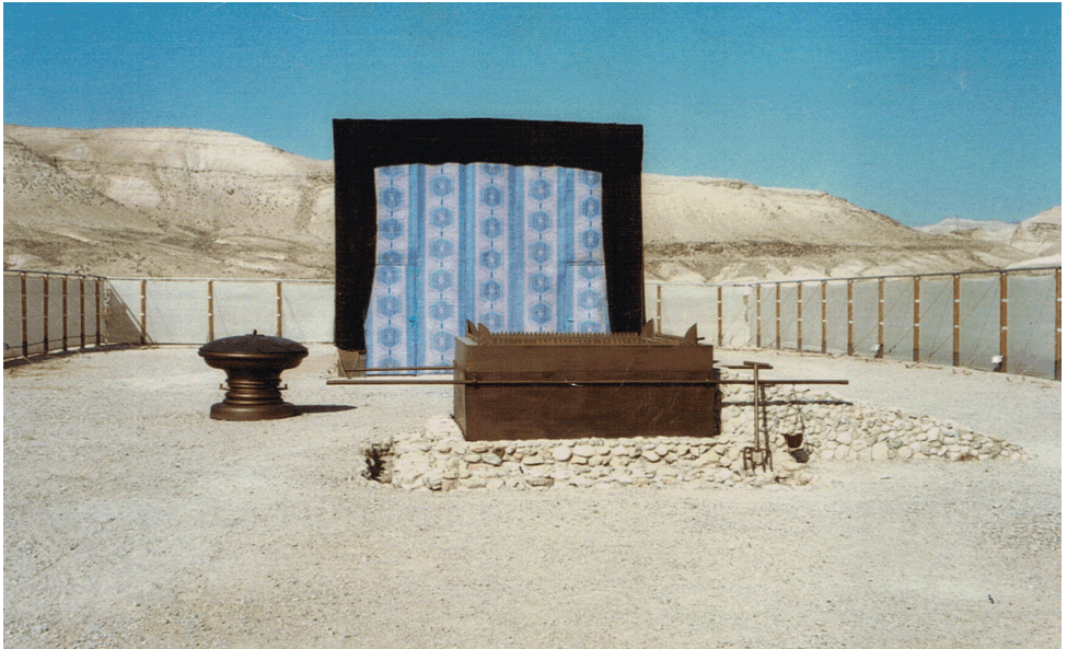
Replica of Moses Tabernacle situated in the south of Israel.

Only the briefest of descriptions of the Tabernacle can be given here. For a fuller explanation, see the book 'Eagles Fly High!'